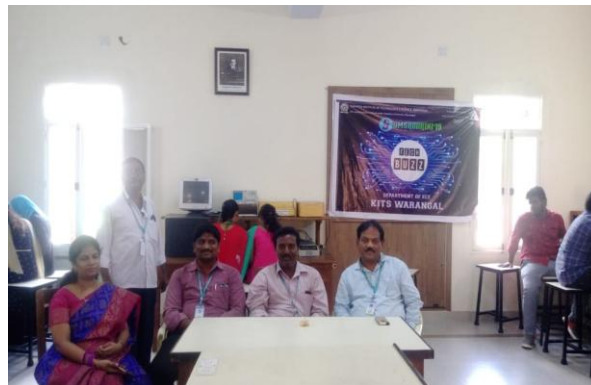
Tech Buzz Winners